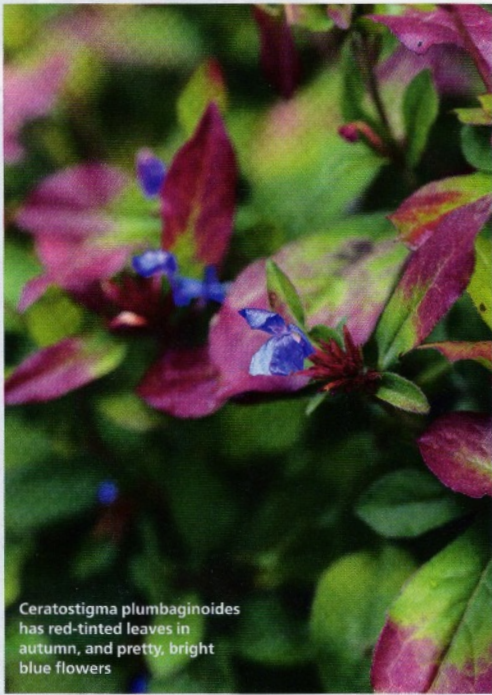
Ceratostigma plumbaginoides has red-tinted leaves in autumn, and pretty, bright blue flowers