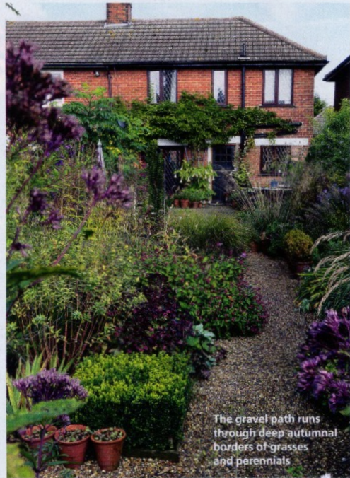
The gravel path runs through deep autumnal borders of grasses and perennials

At this time of year there's a lovely view from the patio, which is edged in vivid orange dahlias, pink salvias, pelargoniums and