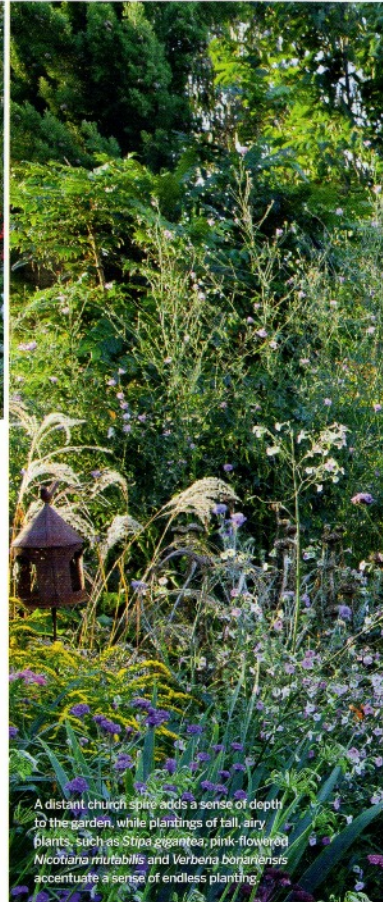
A distant church spire adds a sense of depth to the garden, while plantings of tall, airy plants, such as Stipa gigantea , pink-flowered Nicotiana glauca and Verbena bonariensis accentuate a sense of endless planting.