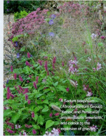
A Sedum telephium (Atropurpureum Group), 'Xenex', and Panicaria amplexicaulis 'Inverleith' add colour to the explosion of grasses.