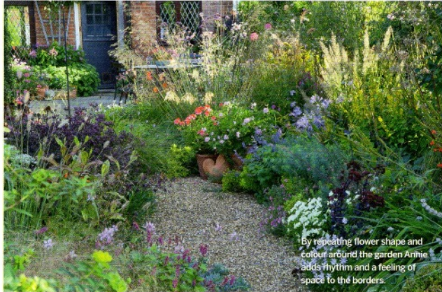
By repeating flower shape and colour around the garden Annie adds rhythm and a feeling of space to the borders.