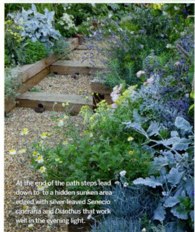
At the end of the path steps lead down to a hidden sunken area edged with silver-leaved Senecio cineraria and Dianthus that work well in the evening light.