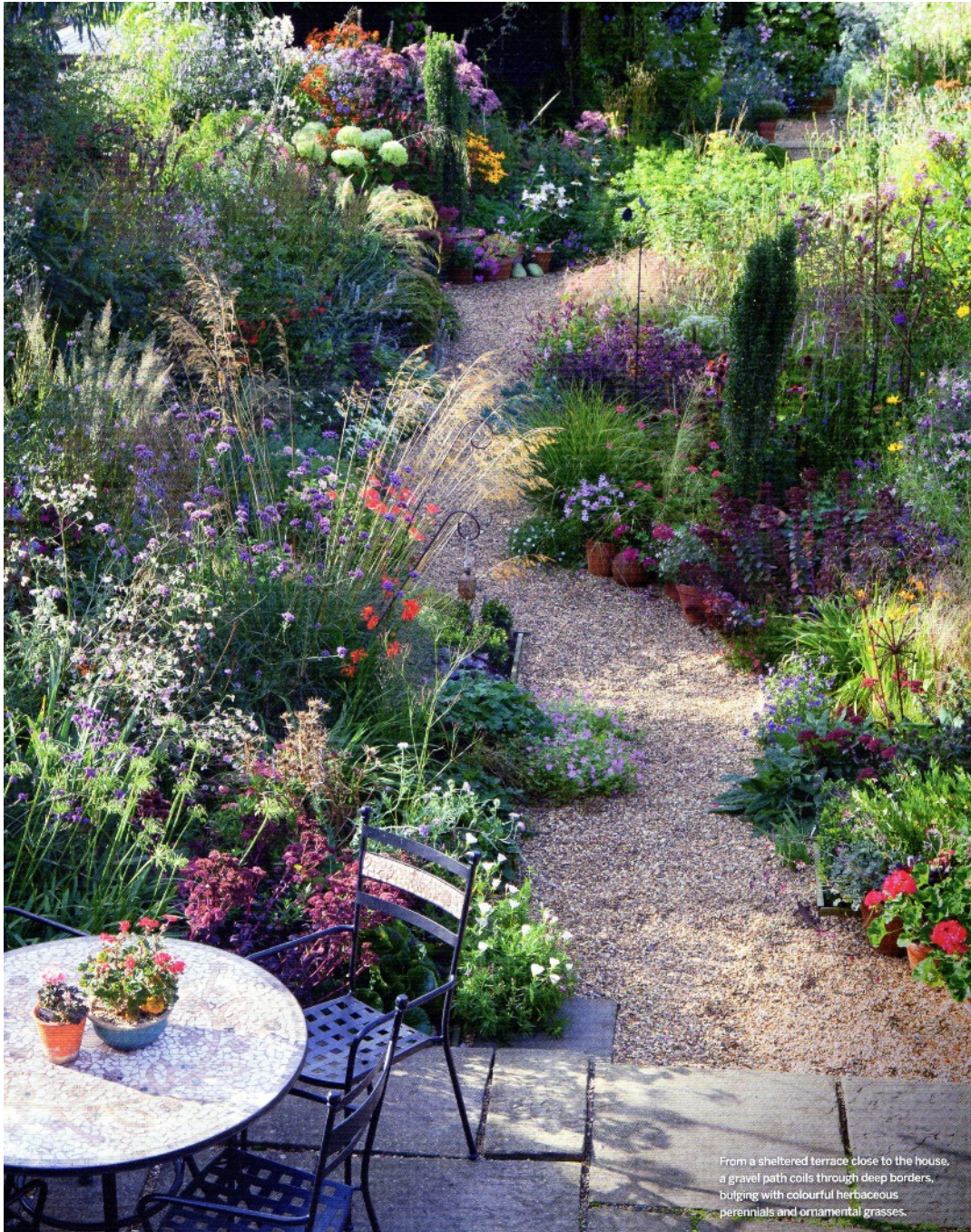
From a sheltered terrace close to the house, a gravel path coils through deep borders, bulging with colourful herbaceous perennials and ornamental grasses.