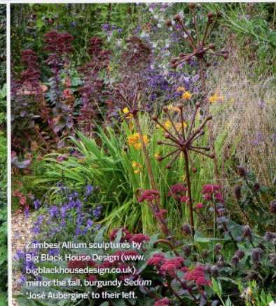
Zambesi Allium sculptures by Big Black House Design ( www.bigblackhousedesign.co.uk ) mirror the tall, burgundy Sedum 'Jose Aubergine' to their left.